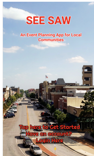
Rough Homepage Design

When users enter the application, they will be able to log in or go straight through to the home page. When logging in, users will either provide their SeeSaw credentials or log in through Google. Logging in through Google will be handled by Firebase Authentication. When a user reaches the home page they can see a list of upcoming events that populate the home page based on people and particular tags that they follow. Users will also see a small banner reminding them of upcoming events that they have marked as “going”. Events within a radius of 5 to 10 miles will be given preference when populating the feed. Clicking on a particular event will expand the event out to a full page and show information about the time, location, user, and tags associated with the event as well as a set of buttons for the user to mark the event as “going”, “save for later”, or “not interested”.